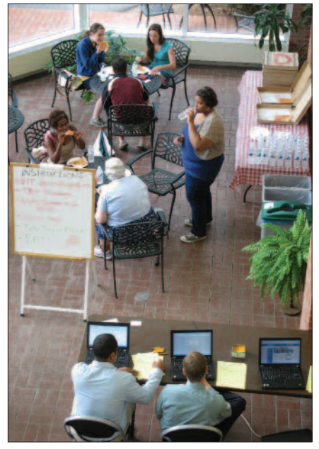
Students testing out Summon and eating pizza, a bonus for participating

Want to try Summon/Drew Library? You can find the Summon search box on the Library's pages (www.drew.edu/library/).