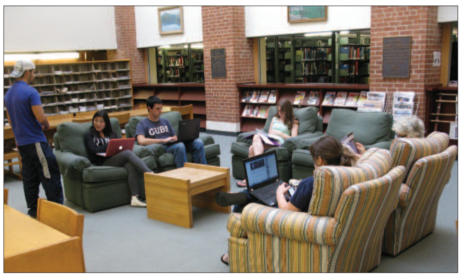
The comfortable chairs in the atrium are favored by students

To some extent, the pattern of actually using the carefully selected resources