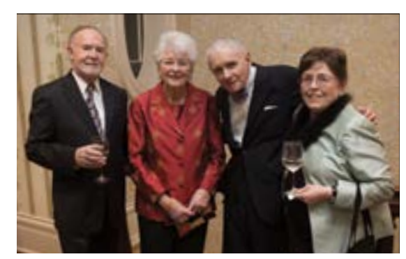
Engaging conversations: Book lovers and Library supporters mingle during the cocktail hour.