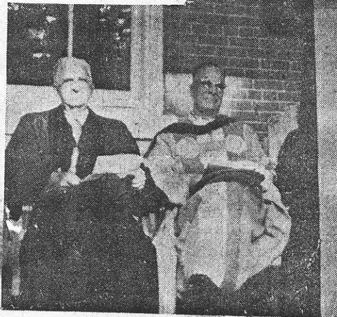
Dr. Robert Fisher Oxnam addresses throng.